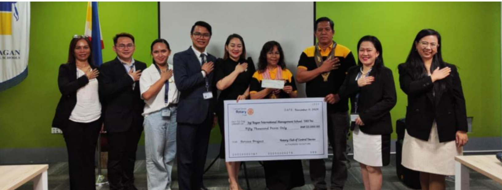
NOVEMBER 11, 2024 | TURNOVER OF PHP50,000.00 TO YPS CHAMPION FOR SERVICE PROJECTS