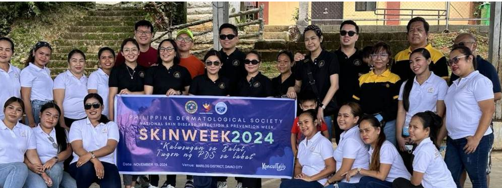
NOVEMBER 10, 2024 | DERMATOLOGICAL MEDICAL MISSION AT BRGY DATU SALUMAY