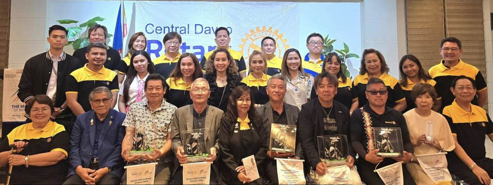
NOVEMBER 18, 2024 | 5TH REGULAR MEETING AT STAR HOTEL, DAVAO CITY