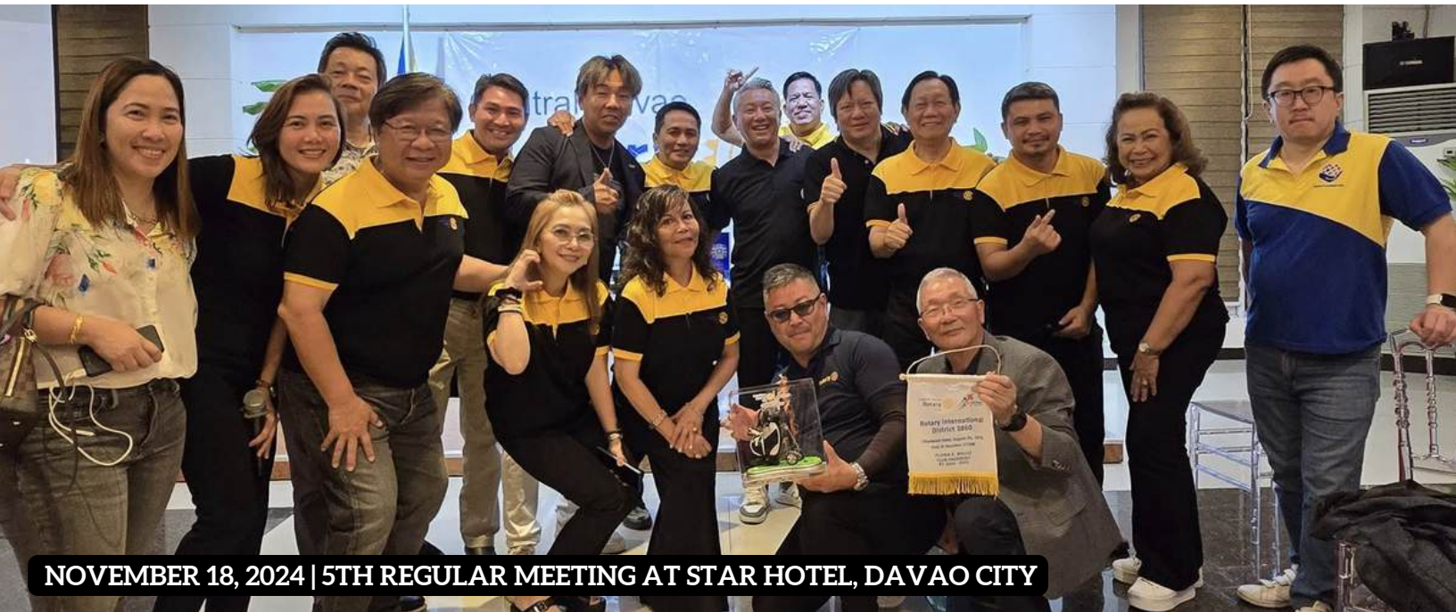
NOVEMBER 18, 2024 | 5TH REGULAR MEETING AT STAR HOTEL, DAVAO CITY